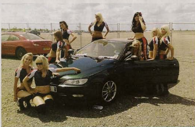
The Garo 406 Coupé proved popular at FCS09 and here is a picture of the Galileo Green and nine Flux babes ...