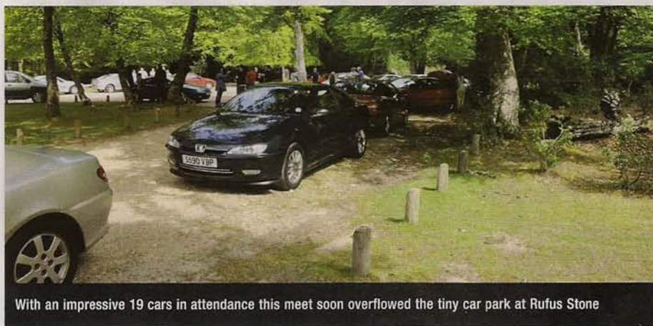
With an impressive 19 cars in attendance this meet soon overflowed the tiny car park at Rufus Stone