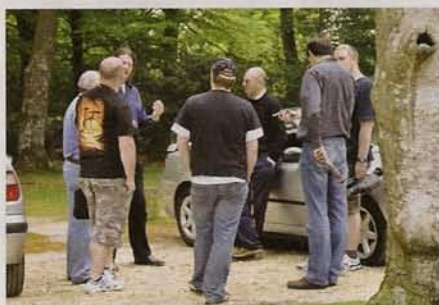
The woods were an idyllic spot to stop and chat about all things 406 Coupé

the New Forest was selected for the meet on Sunday May 10. A total of 19 Coupés attended the idyllic setting of Rufus Stone although not all stayed for the end of day group photograph. The meet started at the Rufus Stone car park at 10:30 and pretty soon the public car park was full of 406 Coupés much to the surprise of dog walkers, horse riders and other members of the public that kindly put their non-406 Coupé rides onto the road. There were several regulars at the meet and several first timers including Garo (Gareth) in his Galileo Green with rare Nautilus wheels usually only seen on the limited edition 'Silver & Black' and Settant'anni models. Also making an impression was Alfie in his supercharged Scarlet Red – talk about a wolf in sheep's clothing. Other vehicles passing by the meet included an old Bugatti and an old Citroën H-van. The day included the usual