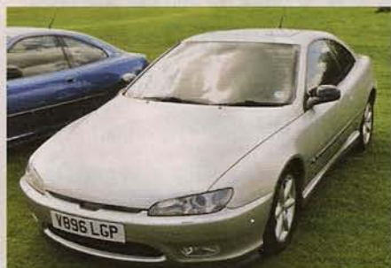
This Satellite Grey beauty belongs to Colin (aka V6_coupe) and features the classic Starfish wheels, a de-badged bonnet, a de-badged and de-locked boot, 607 style lion boot badge, induction kit... the list goes on