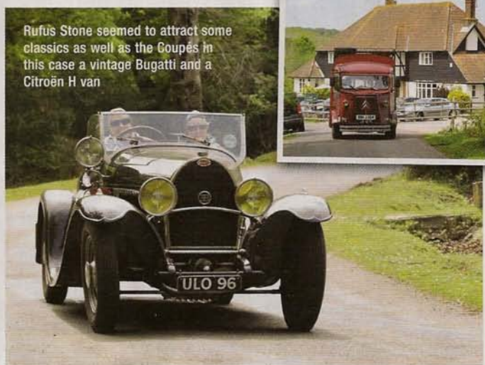
Rufus Stone seemed to attract some classics as well as the Coupés in this case a vintage Bugatti and a Citroën H van