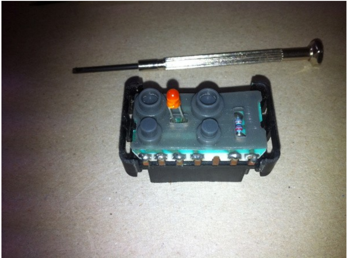
New LED + Resistor