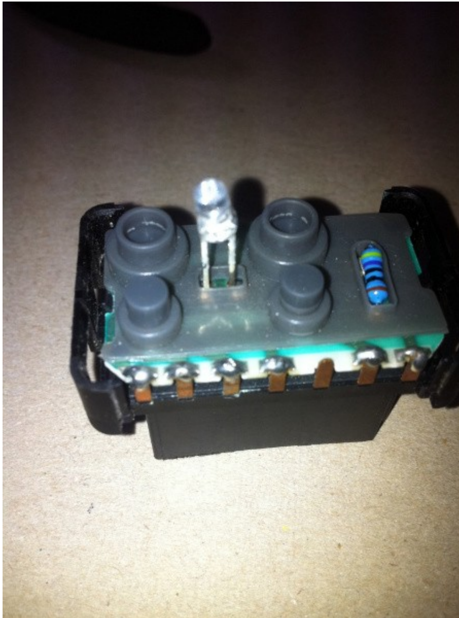
Then Put Switch Back together