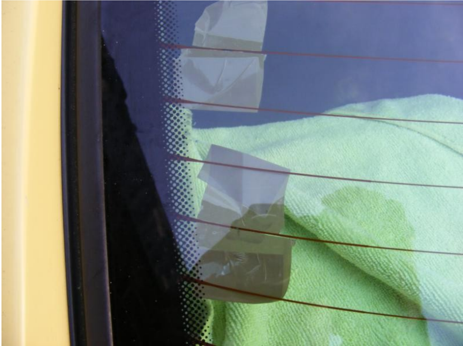
Close up of one of the many breaks: