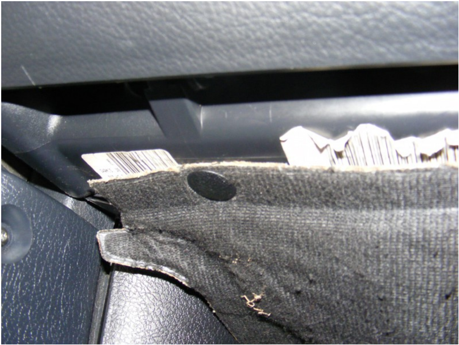
You could just pull these away, but I used the pry tool just for reference: